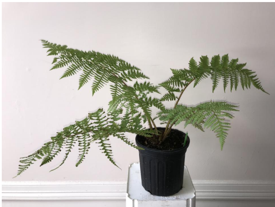
Submitted by Pat Hudnall