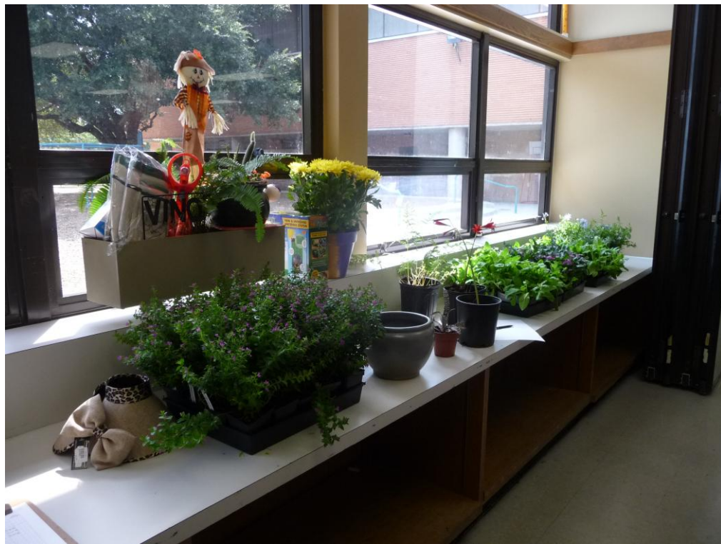
Another nice raffle